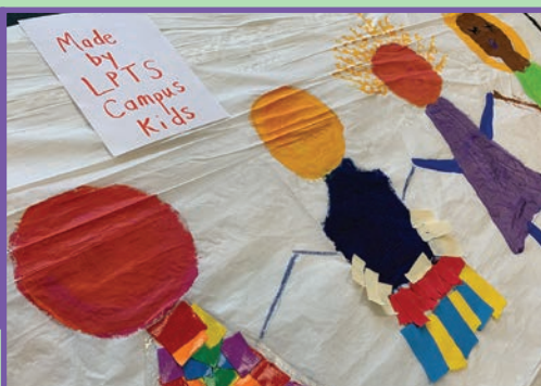
At least 23 campus friends voices were heard reading the words of a myriad of distinct African American writings.