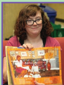
The third annual AFRICAN AMERICAN READ-IN was a success!