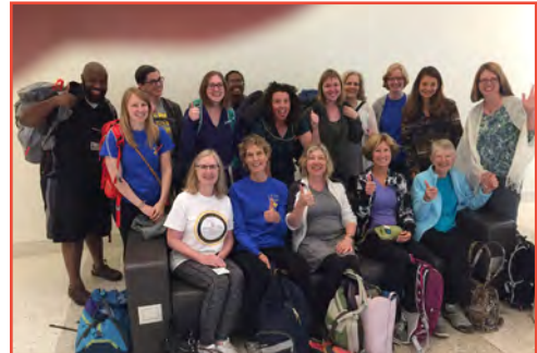
Louisville Seminary Camino De Santiago Travel Seminar Click here to follow their journey on Facebook.